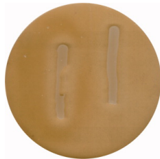
Staphylococcus aureus ATCC 25923